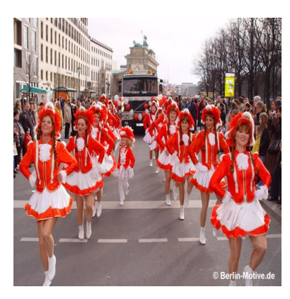
The so-called "Funkenmariechen" are in Germany on any Carnival Parade!